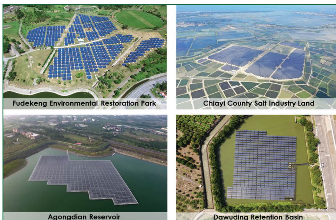
Figure 4: PV-ESCO showcases of ground-mounted type

Chinese Taipei is a densely populated island and roughly two-thirds of the country is mountainous. As such, the land constraint is an important issue, especially for the deployment of large utility-scale ground-mounted solar PV parks. Therefore, the government has been working on establishing a proper siting decision mechanism that can assure the public about environmental and ecological concerns while assisting the renewable energy companies in alleviating the challenges and barriers with promoting solar PV. The unique features of ground-mounted