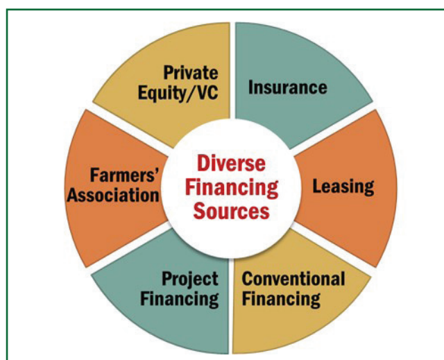
Figure 2: Illustration of diverse financing sources for PV-ESCO business

Since one of the fundamental requirements of the PV-ESCO model implementation is that it needs to build on offering solid financial support to the PV site producer. Therefore, in order to provide a friendly investment environment and flexible loan programs, the BOE visited several financial organizations such as associations of banks, local banks, and insurers to introduce FiT operations and loan programs for solar PV systems (see Fig. 2). The current policy and business model were modified after collecting feedback and recommendations from these financial sector stakeholders to create a well-established market for residents and solar PV producers that includes sound loan mechanism, professional consulting and open opportunities. Several hundred employees from financial institutions have been trained to facilitate the solar PV loan model, in risk assessment and control, and to build communication platforms for policy advocacy. Each year, the BOE invites relevant governmental and non-governmental organizations, scholars, and experts to reassess tariff calculation. Based on inputs from these stakeholders, the tariffs are determined for solar power specific to the technology, type of system (rooftop or ground-mounted), and location. The idea is to provide reasonable return for solar PV investors through financial support from banking institutions, hence leading the PV-ESCO business model to further drive solar PV expansion and meet the goals of solar PV deployment.