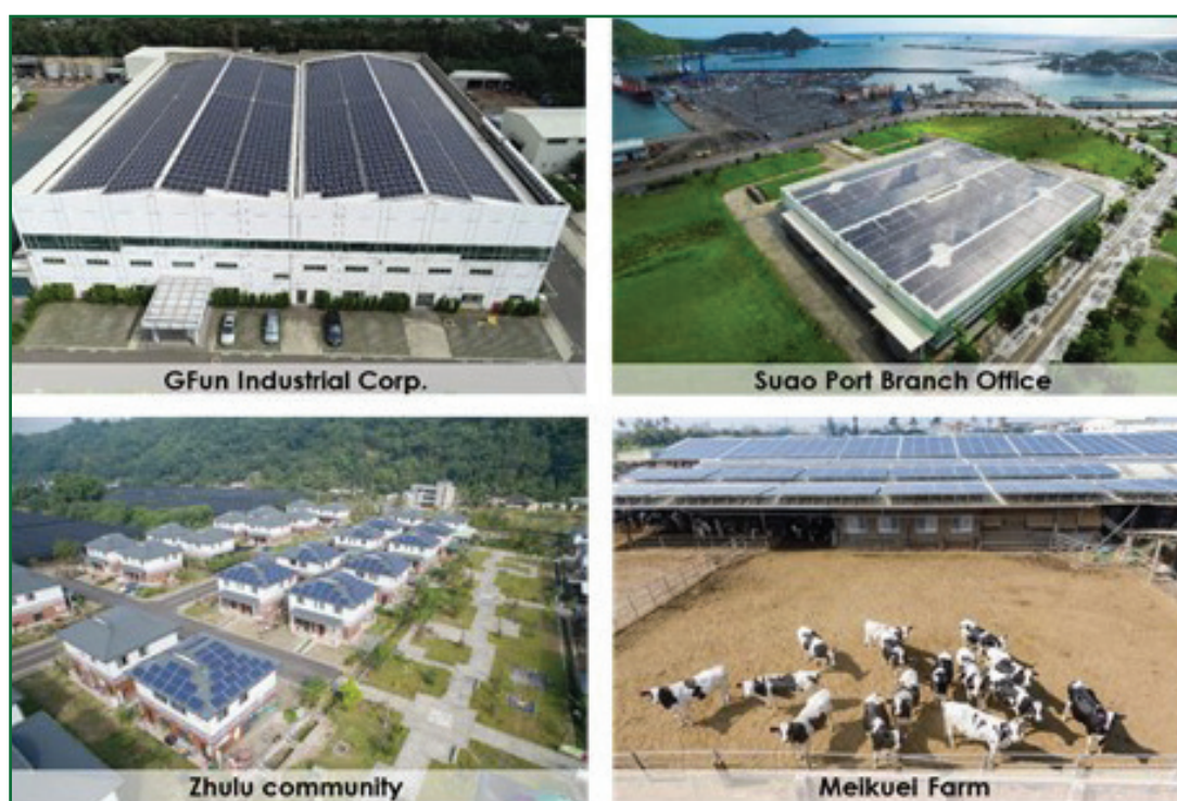
Figure 3: PV-ESCO showcases of rooftop type

In terms of benefit and impact of installing solar PV, it is estimated that 1 kW of solar PV installation could contribute to more than six hundred kg of carbon dioxide reduction annually. Also, it is important to note that since most of ESCOs are specialized in energy conservation and retrofit engineering for weatherization projects, solar PV systems installed on rooftops reduce the thermal stresses on buildings by lowering the roof temperature and thereby enabling reduced energy consumption of indoor air conditioning, as such, one of the immediate and obvious benefit of installing the rooftop solar panel is the reduction of the climate control cost. For example, in a recent interview 8 , the owner of Meikuei Farm, a dairy farmer who was going to renovate her 25-year old farm house, was ad-